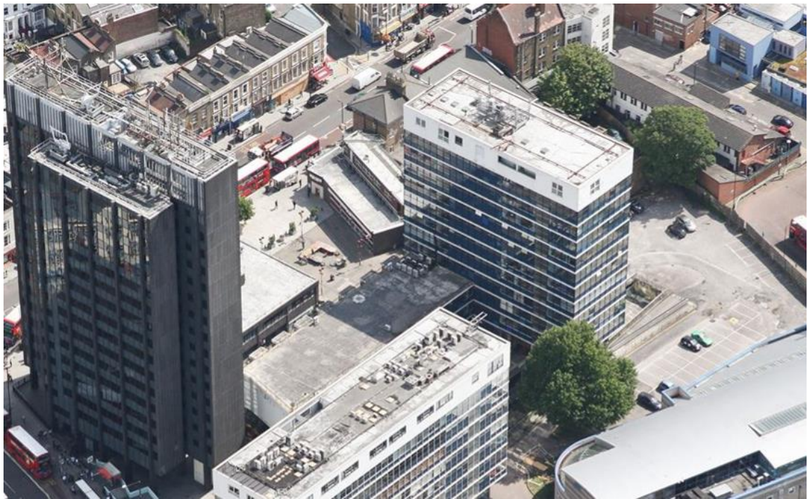
Existing building (looking west)