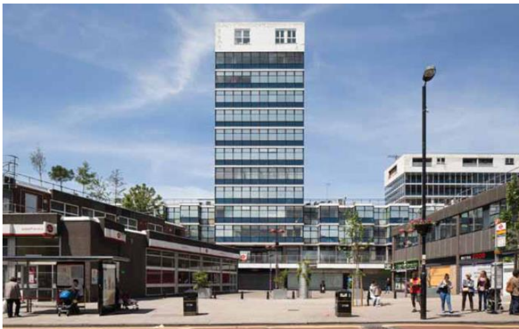
Existing building and Archway Town Square from MacDonald Road