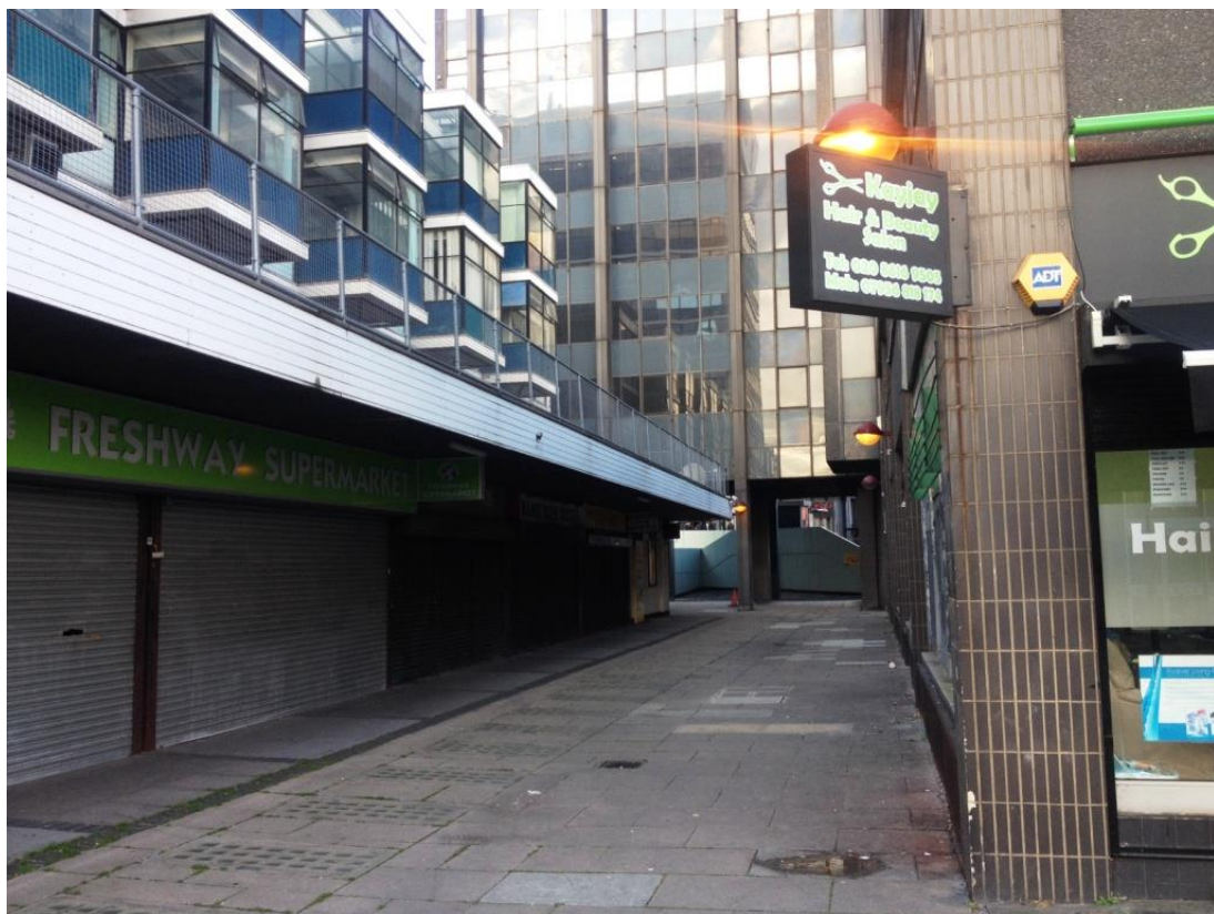
Existing shopfronts at the base of Hill House and pedestrian route to Holloway Road