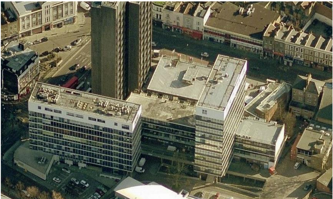
Existing building (looking south)