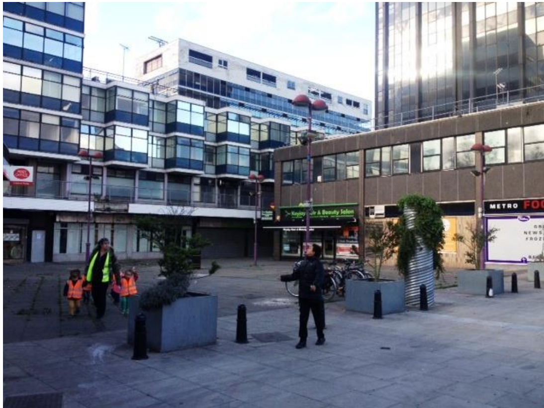
Archway Town Square