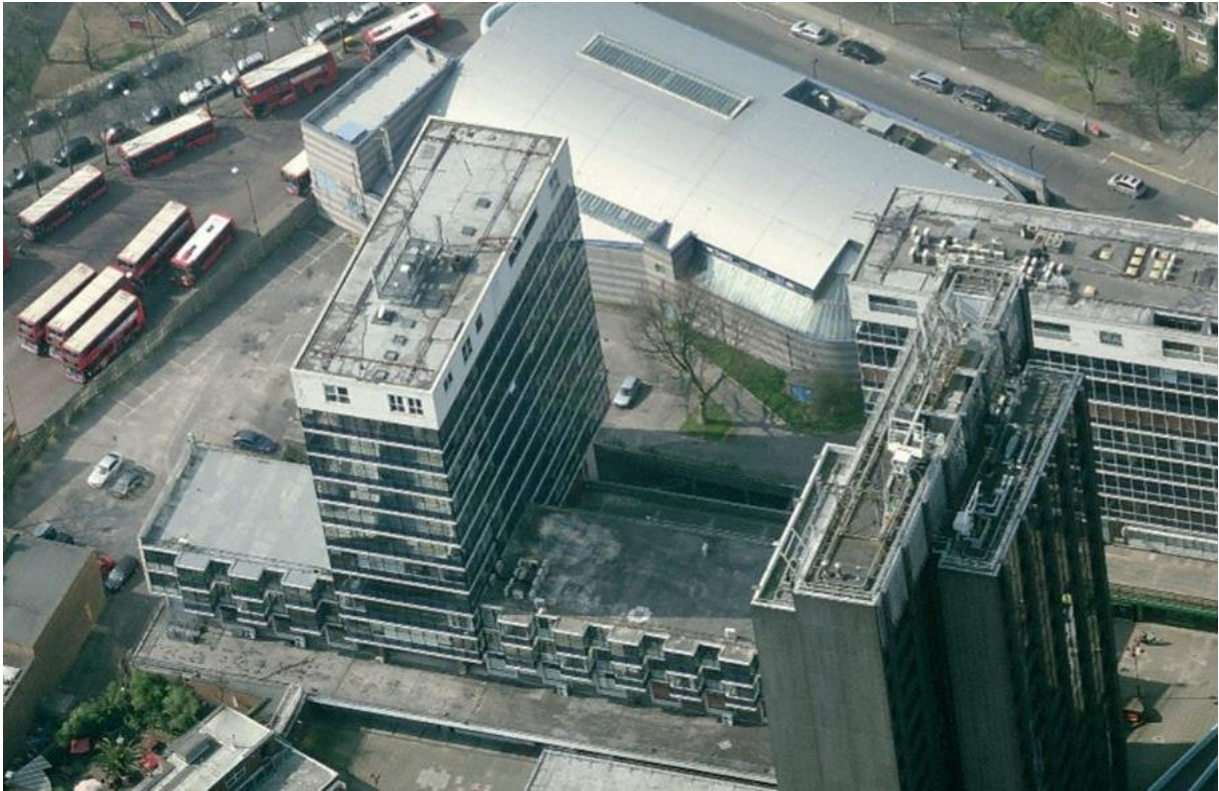
Existing building (looking north)