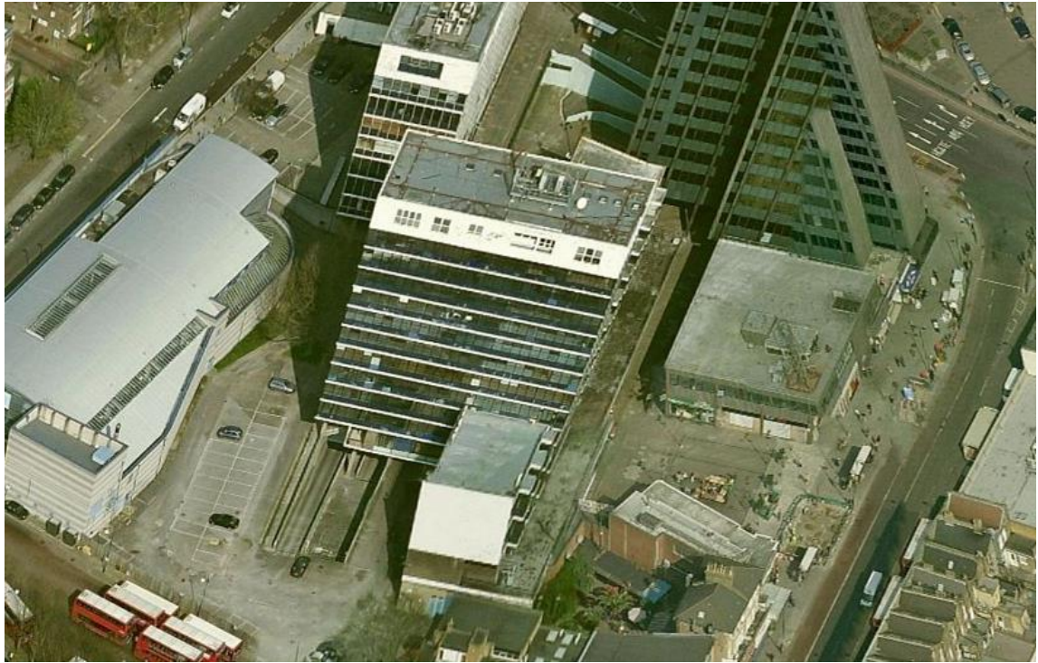
Existing building (looking east)